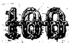
Fig 3. Currency Denomination Value With Average Filter.