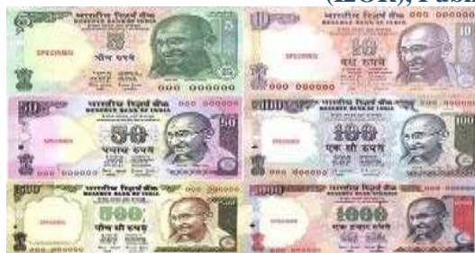
Fig 1. Copy of Different Indian Paper Currency.

The ROI's are scanned for the different types of paper currencies and saved. Since these ROI's remain constant for all the genuine currencies, they can be efficiently used for detection of the type of currency.