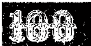
Fig 5. Currency Denomination Value With Laplacian Filter.

The pattern recognition and neural networks technique is used for matching image pixels. The multilayer neural network match each pixel of given sample and provide the exact match.